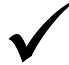
Cash Registers / POS Terminals