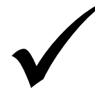
Remote Car Starters